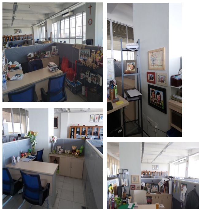
Picture 3, they are showed several implementations of the workspace personalization of the research object lecturer.

The findings of this study indicate that the implementation of personalized cubicle workspace is important. The employees (refer to interior lecturers) agree that there are two equally important reasons for personalizing their cubicle workspace. This cubicle space can help to express their identity and show to other employees that this cubicle is my work area and mine only. They display photos of family/close friends or personal items that characterize themselves as an example to express their identity. For example, a lecturer displaying his favorite items with various forms of cows from pillows, tissue cases, pencil cases, dolls, to accessories filling his cubicle. Another example, a lecturer expressed his cubicle workspace by displaying miniature traditional houses and statues from various regions in Indonesia. He is showing his identity and status as a lecturer in history and culture. Then, by 81.82%, showing status is the next reason they personalize their cubicle workspace. They display student work such as interior mockups, furniture mockups, macrame, and other things to show their status as lecturers according to the courses they teach.