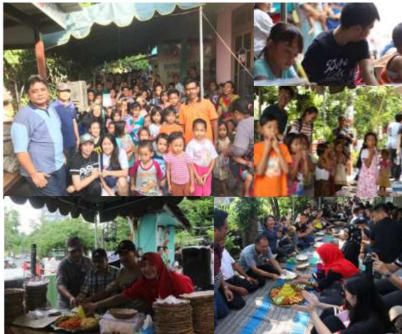
Picture 8. Social Activities during Service-Learning Projects