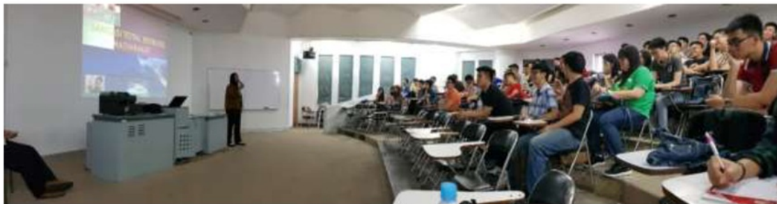
Picture 2. Guest Lecture by Local Health Practitioner

While both the old and new Service-Learning based classes shared several topics, several changes are made. Sustainable development concept is put on the forefront. And thus, most of the class topics are viewed from sustainable development viewpoint. In this case, sustainable development is not limited to its ecological impact but also its economic and social aspects. This is the most critical part of the change. The expansion of the sustainable concept required engineers to not only look at the ecological impact of its future construction, but also the human impact. Aside from the fact that the United Nation Brundtland Commission defined sustainable development as that, the importance of considering the human impact can be demonstrated using simple illustration that is taught in the new SL EnSci class. In Indonesia, several high-rise projects received backlash from the local populace because the high-rise building blocked the local populace's TV signal. Thus, the project cannot be considered sustainable because the local populace opposed it publicly.