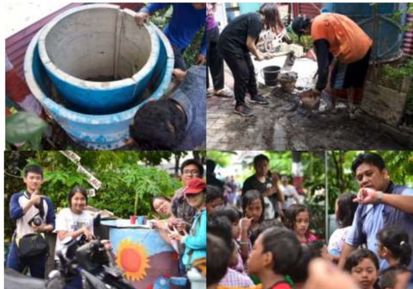
Picture 6. Compilation of The Third Service-Learning Class Project.