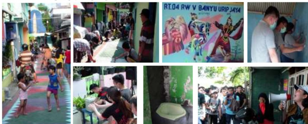
Picture 4. Compilation of The First Service-Learning Class Project.