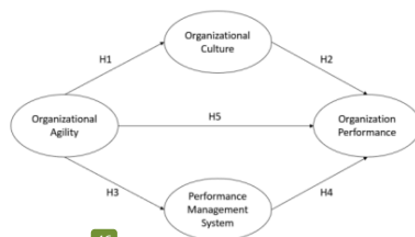
46 Figure 1 Research Framework